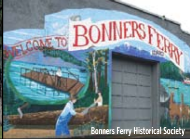
Bonners Ferry Historical Society