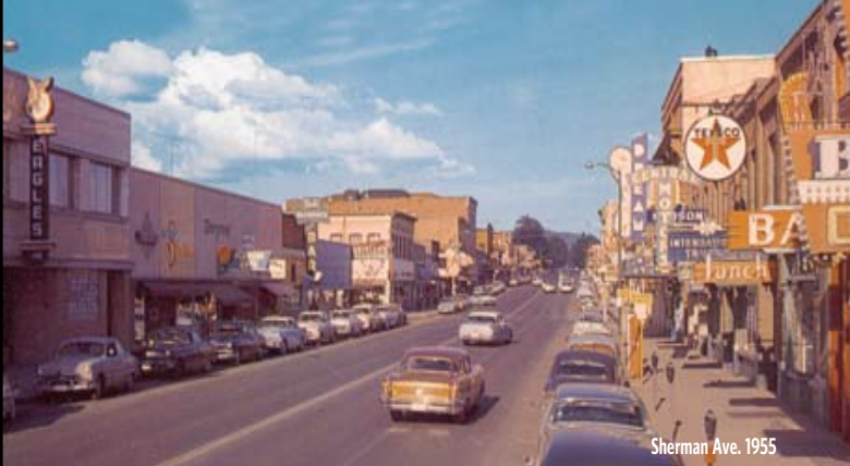
Sherman Ave. 1955