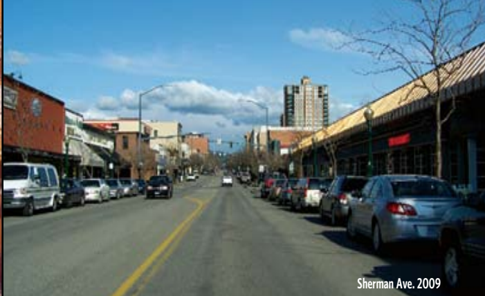
Sherman Ave. 2009