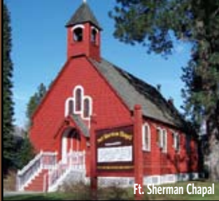
Ft. Sherman Chapel