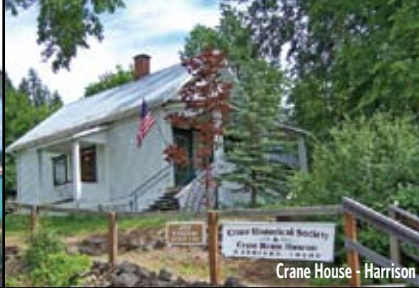
Crane House - Harrison