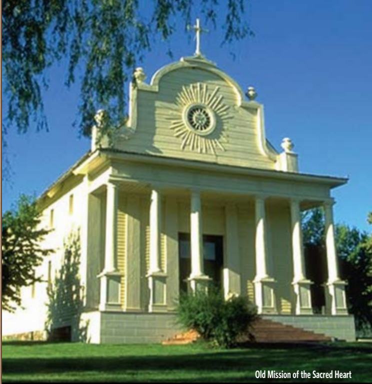
Old Mission of the Sacred Heart