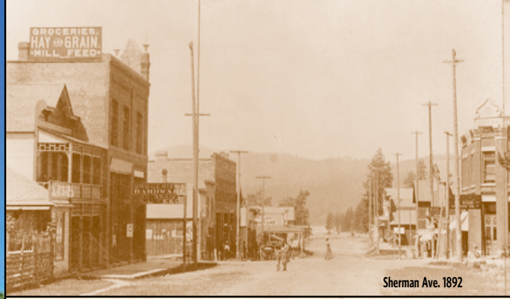
Sherman Ave. 1892