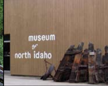
museum of north idaho