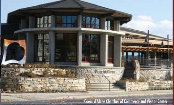
Coeur d'Alene Chamber of Commerce and Visitor Center

Falls' Q'emlin Park was built by the Post Falls Lions Club. Volunteers serve on commissions and boards in each Panhandle town.