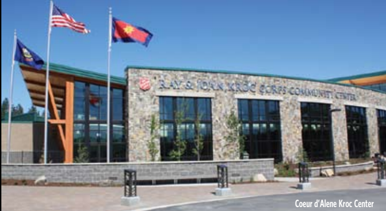
Coeur d'Alene Kroc Center