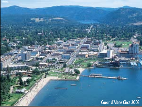
Coeur d'Alene Circa 2003